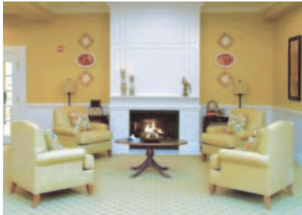
Top: Inside Village apartment Bottom: The Village lobby area

Call today to arrange a personal tour! 304-285-5575 or toll-free 877-285-5575